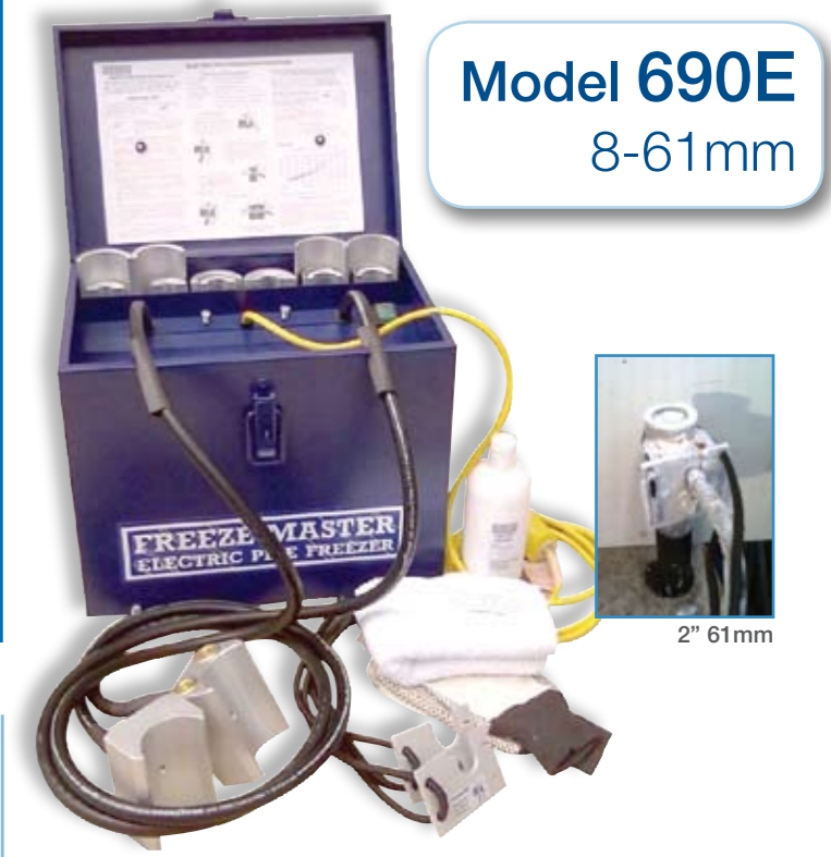
Model 690E 8-61mm