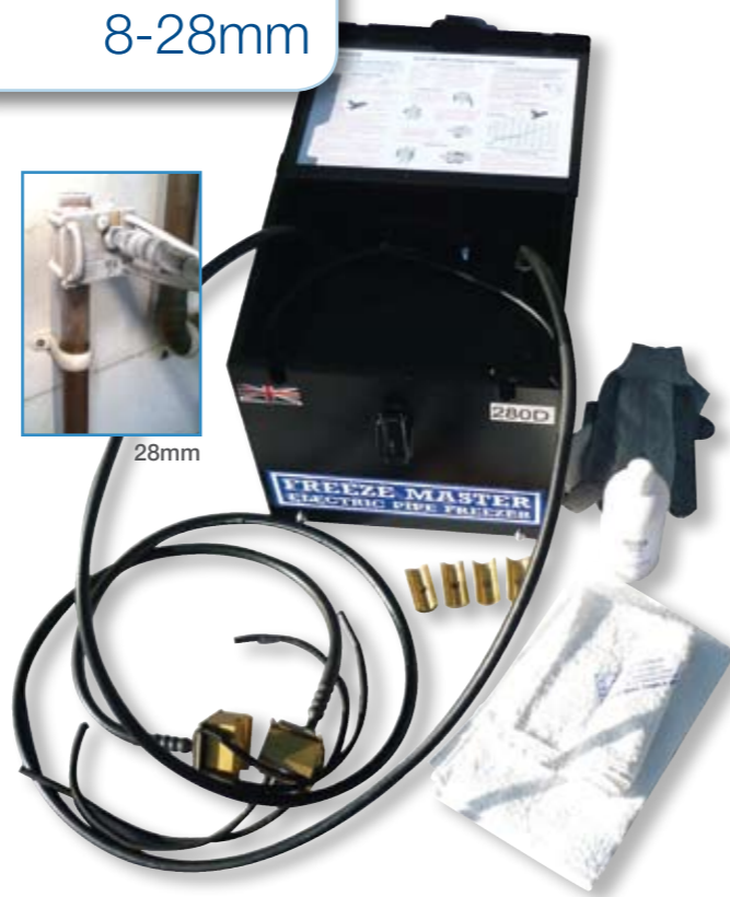
Model 280D 8-28mm