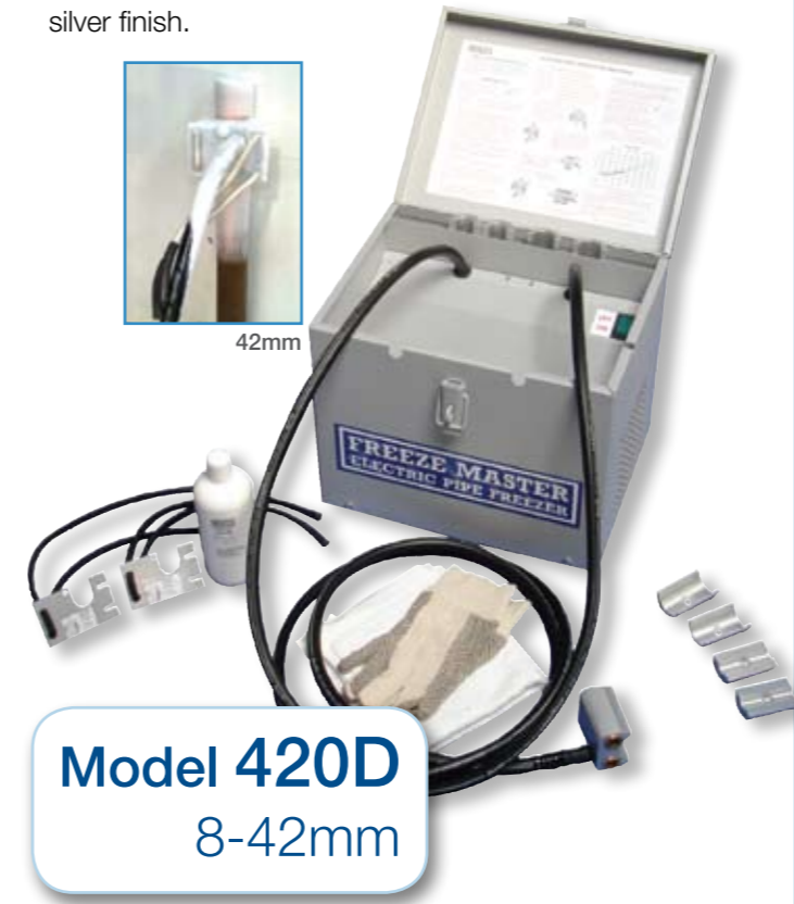
Model 420D 8-42mm